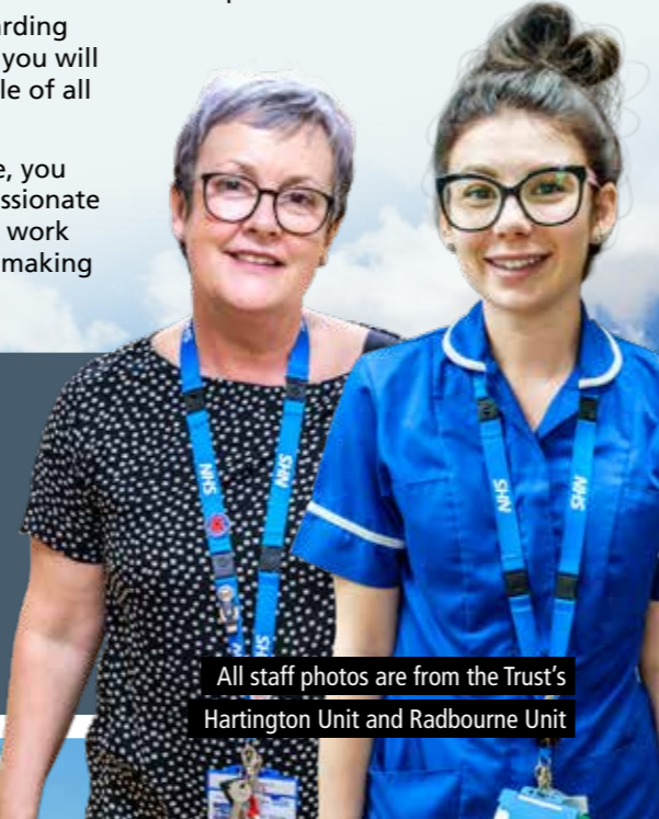
All staff photos are from the Trust's Hartington Unit and Radbourne Unit

"The staff have helped me a lot through my good and bad moments and I've learned to do things for myself, accept help and responsibility and become as independent as possible..." - A Derbyshire Healthcare patient